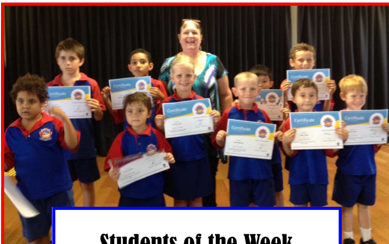
Students of the Week