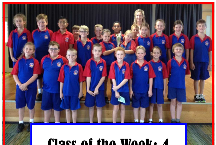
Class of the Week: 4